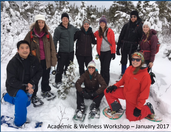
Academic & Wellness Workshop – January 2017